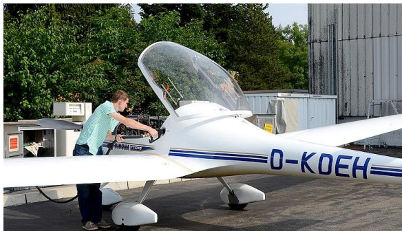
Refuelling