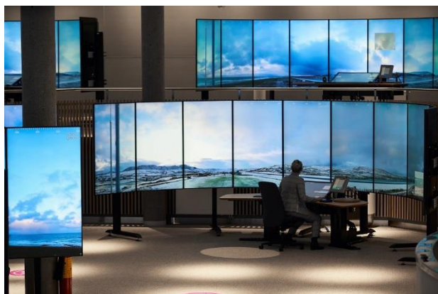
The World's largest Remote Towers Centre at Bodo in Norway

NPA 2022-02 Remote tower operations (consultation closed 2/8/2022)