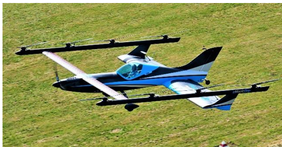
The shape of things to come for leisure aviation? - the eMagic One VTOL prototype

This EASA consultation proposes a whole set of new and interesting regulations related to the operation of future manned VTOL (or eVTOL) (Vertical Take-off and Landing) aircraft.