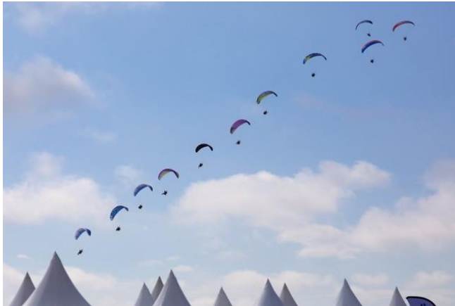
Paramotors flying in formation over exhibition tents at the EMF General Conference at Blois

Welcome to the Autumn issue of the Europe Air Sports Newsletter! We have news of some significant regulation changes which should benefit some of our members. Read on to find out more.