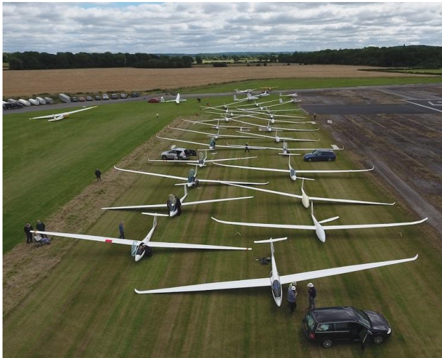
Competition time! Competitors at a gliding competition, almost ready to launch on a nice day