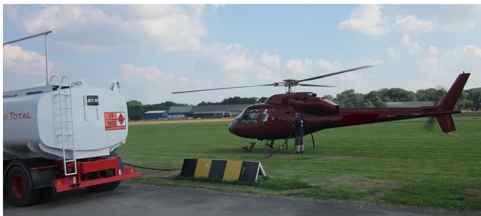
‘Hot’ helicopter refueling

Through the present NPA the Agency wishes to ensure adherence to the International Civil Aviation Organisation (ICAO) after the adoption of Amendment 36 and 38 to Part I of Annex 6. In this Annex, ICAO recognised the need to amend and update the fuel and alternate-aerodrome-selection requirements, many of which have remained unchanged since their adoption in the 1950s, when the aviation world was quite different from today’s.