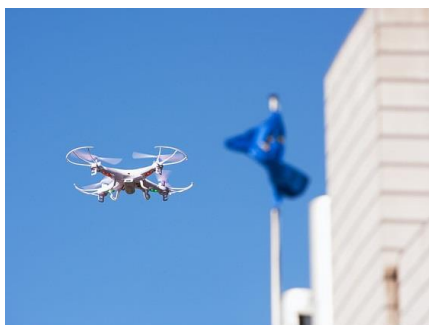
Drone flying over the European Parliament building

At a meeting on 14 July, members of the European Parliament’s Committee on Transport and Tourism (TRAN) considered their draft position on Remotely Piloted Aircraft Systems (RPAS) for civil use. While the European Commission’s Directorate-General for Mobility and Transport (DG MOVE) and EASA advance with their own preparations of common European rules to govern RPAS, the EP has chosen to submit a formal position through a so-called Own Initiative Report.